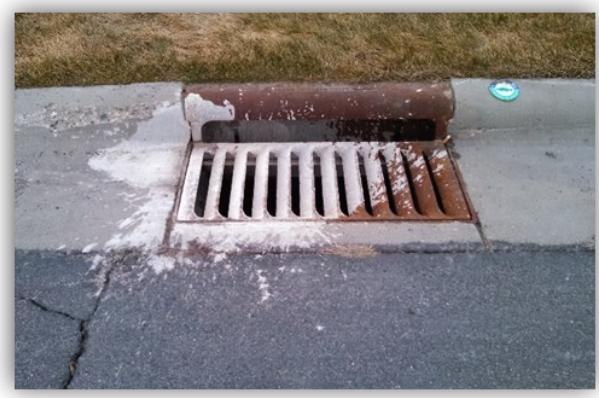
Example of illegal dumping

Report illegal dumping/illicit discharges: (320)-234-5682