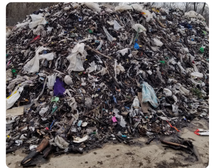
Contaminants pulled from windrows