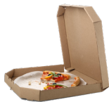
Greasy pizza delivery boxes