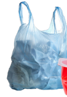
Plastic of any kind