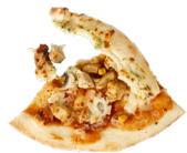
Table scraps and solid food leftovers