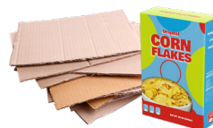
Collapsed large cardboard boxes and shiny cardboard