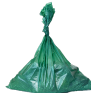
Pet waste and kitty litter