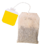
Coffee filters, grounds, and tea bags