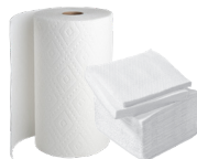
Paper towels and napkins