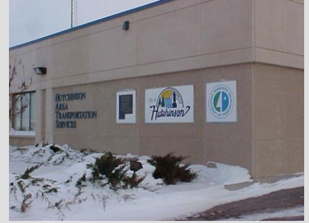
Hutchinson Area Transportation Services (HATS) Facility

The HATS Facility is the result of an effort of between the City of Hutchinson, McLeod County, and the Minnesota Department of Transportation to address facility and operational needs in the area. A first of its kind facility in the State, the three agencies came together to form a Joint Powers Board after the three agencies received a grant from the State of MN Board of Government Innovation and Cooperation.