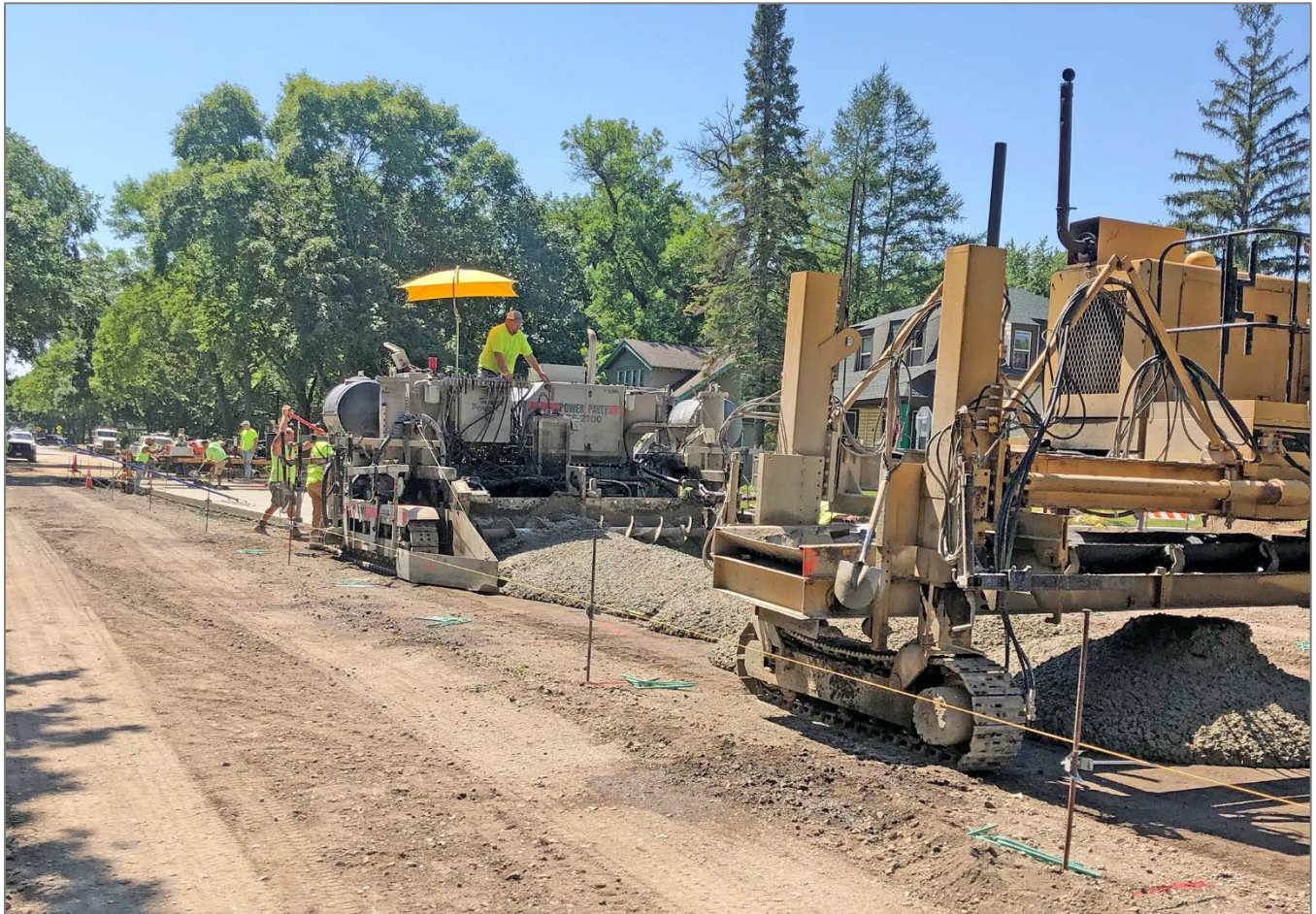
Photo above: Paving operations on Highway 15 between 4 th Avenue South and 5 th Avenue South.

If all continues as planned, the resurfacing of Highway 15 from 5 th Avenue South to County Road 115/Airport Road will begin in early- to mid-September.