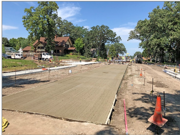
Photos above: (left) cement trucks delivering concrete to the roadway; (right) new concrete pavement on Highway 15 between 4 th Avenue South and 5 th Avenue South.