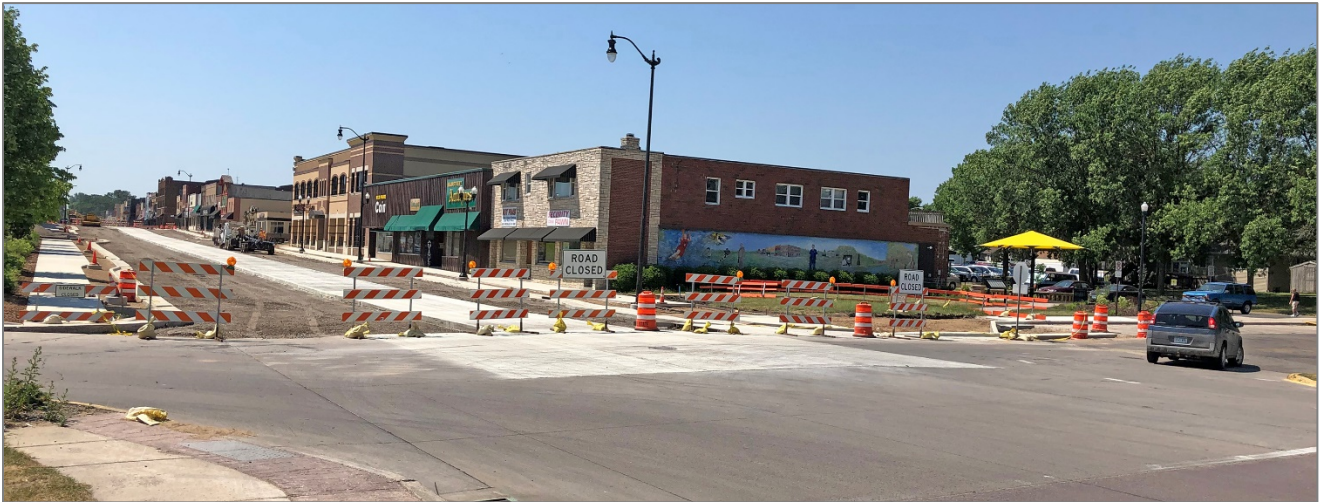
Photo above: a more expansive view of the Highway 15 and 2 nd Avenue North intersection, which has reopened to local traffic.