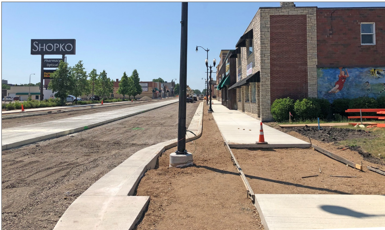
Photo above: looking south from Highway 15 and 2 nd Avenue North. The center 13-foot lane is installed, as well as much of the curb, gutter and sidewalk.

The project continues to run smoothly. We are about 10-14 days ahead of schedule due to the dry weather that we've experienced to date.