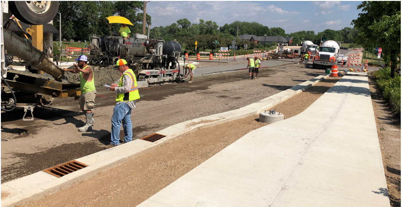
Photo above: Pouring the 13-foot middle lane running from 2 nd Avenue North to Washington Avenue.